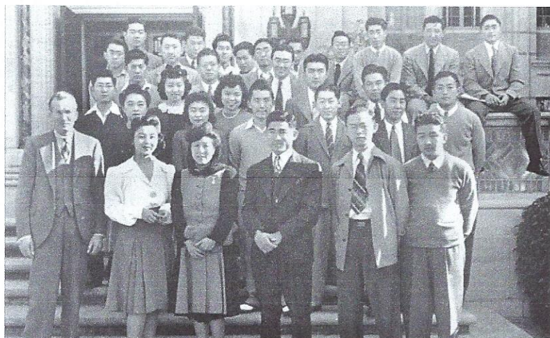
Japanese Trojan Club 1942