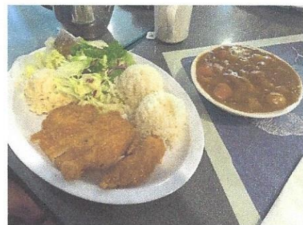
Ladybug Chicken Katsu Curry