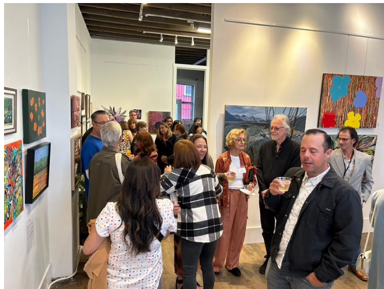
Gallery of Hermosa opening night was standing room only.