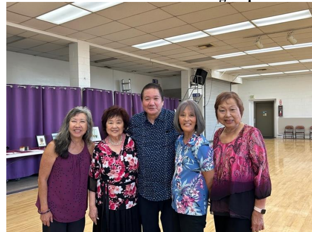
Orange County Sansei Singles