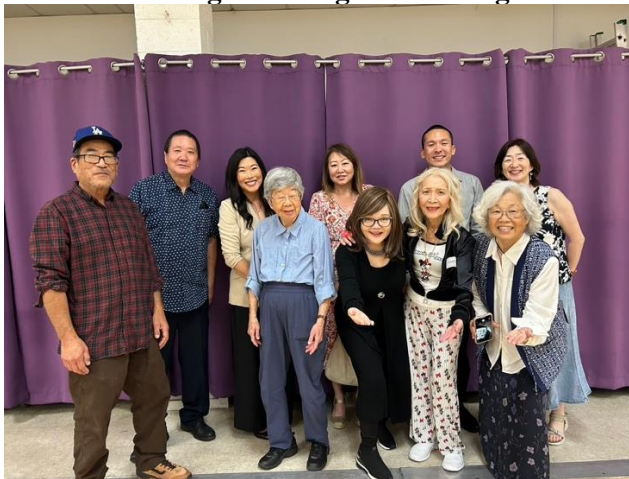
GLA JACL board and dance committee