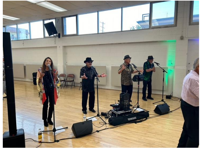
"Asian Persuasion" vocal group