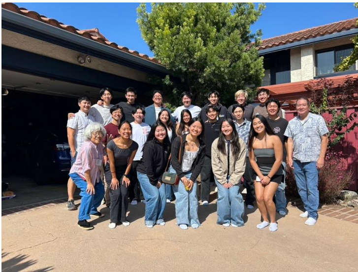
Southern California Intercollegiate Nikkei Council