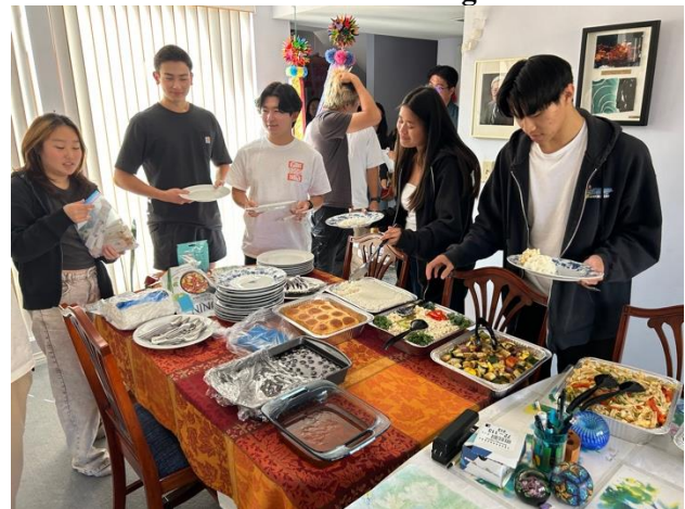
NSU members enjoying the spread