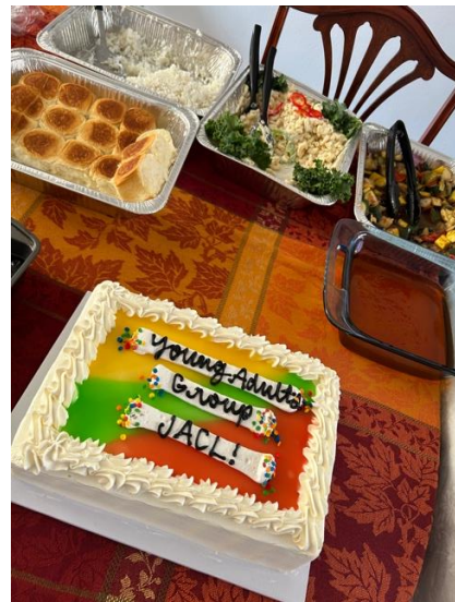
Paradise cake from King's Hawaiian